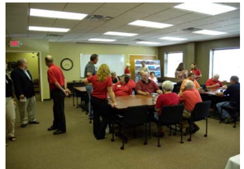
Above Left: The COG's Executive Board meets in the new board room during the COG's open house.