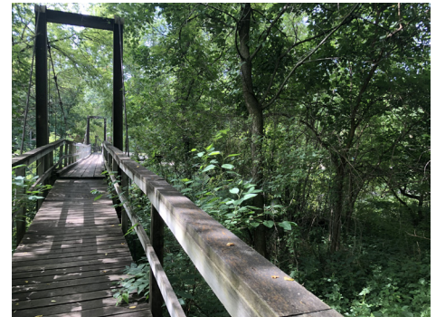
Riverside Park Trail, Coon Rapids

Region XII Transportation Alternatives applications will be accepted through January 26, 2024 until 4:00 PM. Region XII has approximately $1,400,000 in regional transportation alternatives funds available for projects. Funding for these projects may not be available until federal fiscal year 2025 or later depending upon the amount requested. These projects may include recreational trails, highway turnouts, overlooks, safe routes to schools and historic preservation of transportation related structures. (Please see the application form for a full list of eligible projects). The sponsoring agency must provide at least 20% of the total project cost). Click HERE to access the application.